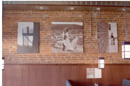
CUSTOM RESTAURANT ART: John Becker suggests different types of visuals and print-treatments for different types of restaurants. The images shown here were printed in sepia tone to complement the brick walls of the Potters on Main restaurant.

Restaurant Décor: Even in small towns such as Red Wing, MN, owners of mom-and-pop restaurants, retail shops, and bed-and-breakfasts have begun to realize they can afford to custom decorate, using images shot by photographers who really appreciate what makes a particular locale so appealing. For the restaurant project shown here, Becker produced two series of wall prints.